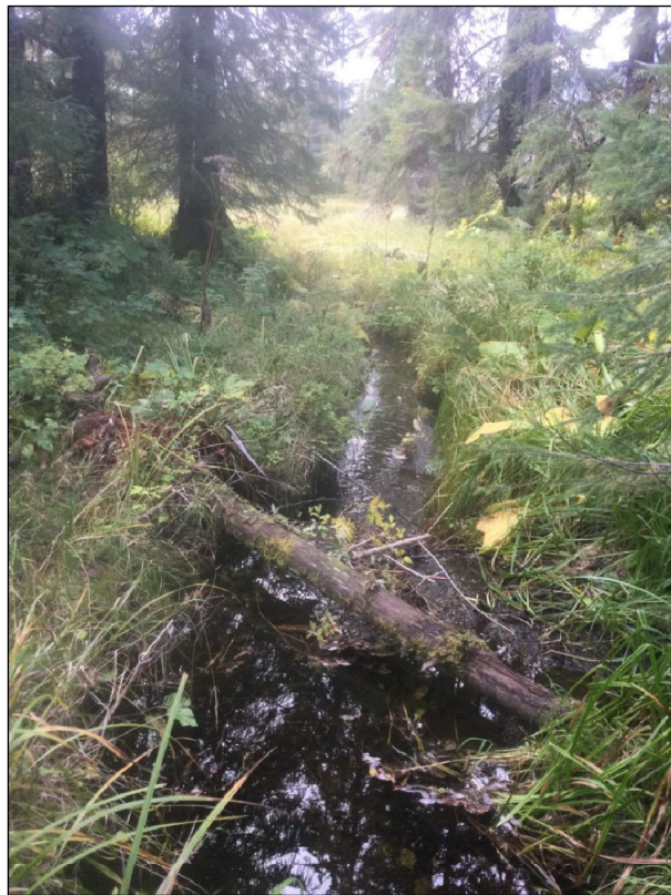
Figure 3.—Channel at waypoint 1859.