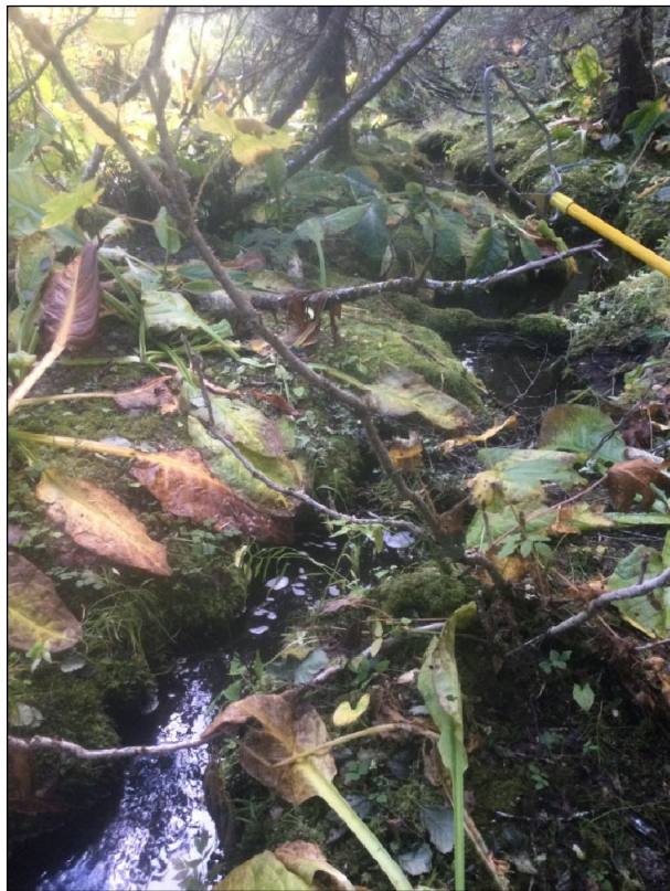
Figure 2.—Channel at waypoint 1860.